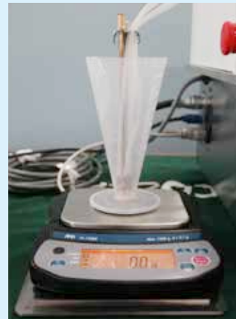
The scale control enables to minimize semen residue.