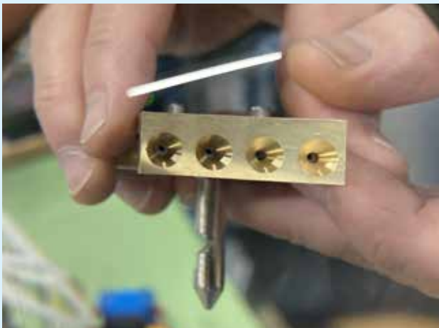
The straw guide attachment on the needles works for smooth insertion.