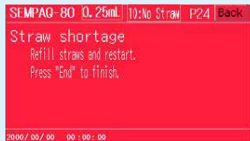
Red: Error detected