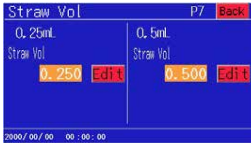
Blue: Settings screen

Screen color informs status of the machine movement.