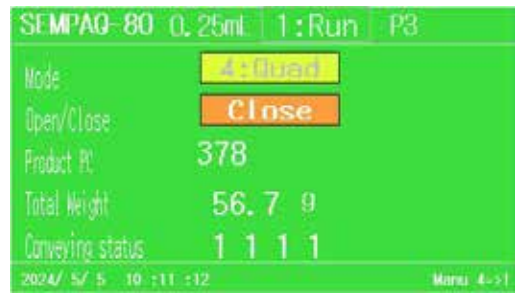
Green: Normal operation