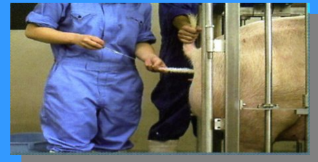
How to use