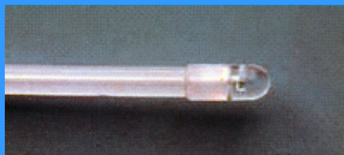
Side eye of inner catheter