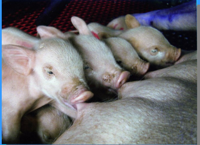
Piglets, produced by embryo transfer